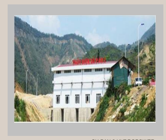
SU PAN 2 HYDROPOWER